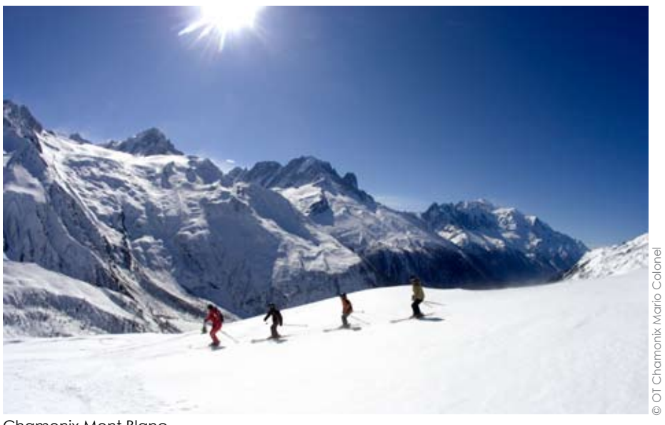
Chamonix Mont Blanc