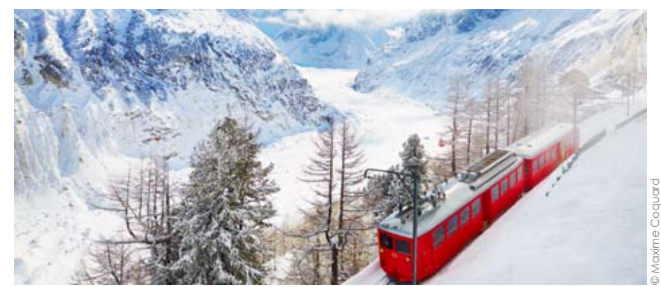
Montenvers Mer de Glace