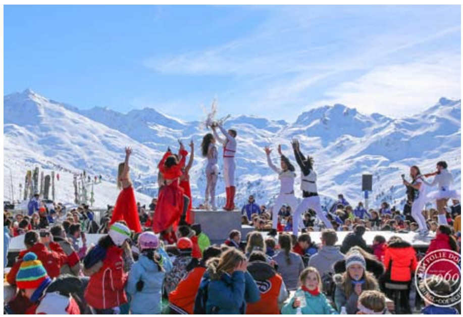
La Folie Dance