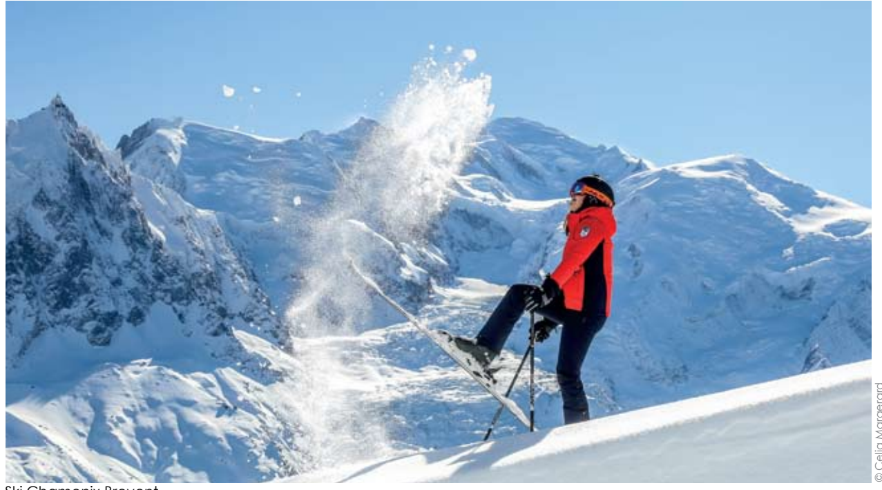
Ski Chamonix Brevent